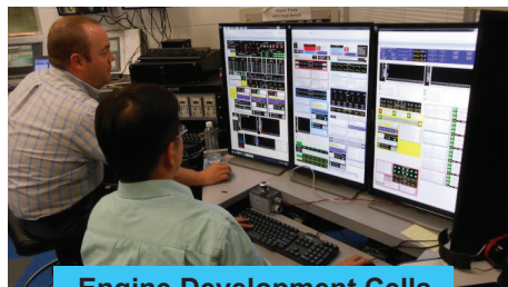
Engine Development Cells