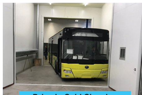
Drive-In Cold Chamber