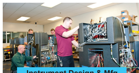
Instrument Design & Mfg